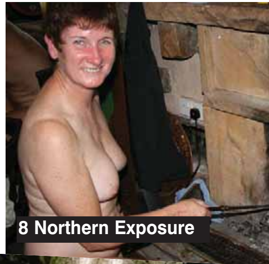
8 Northern Exposure

Three top naturist photographers give their views on how to get the perfect shots