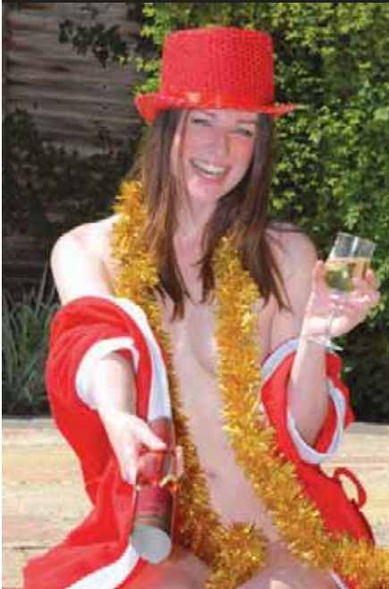
Cover photo of Grace by Charlie Simonds