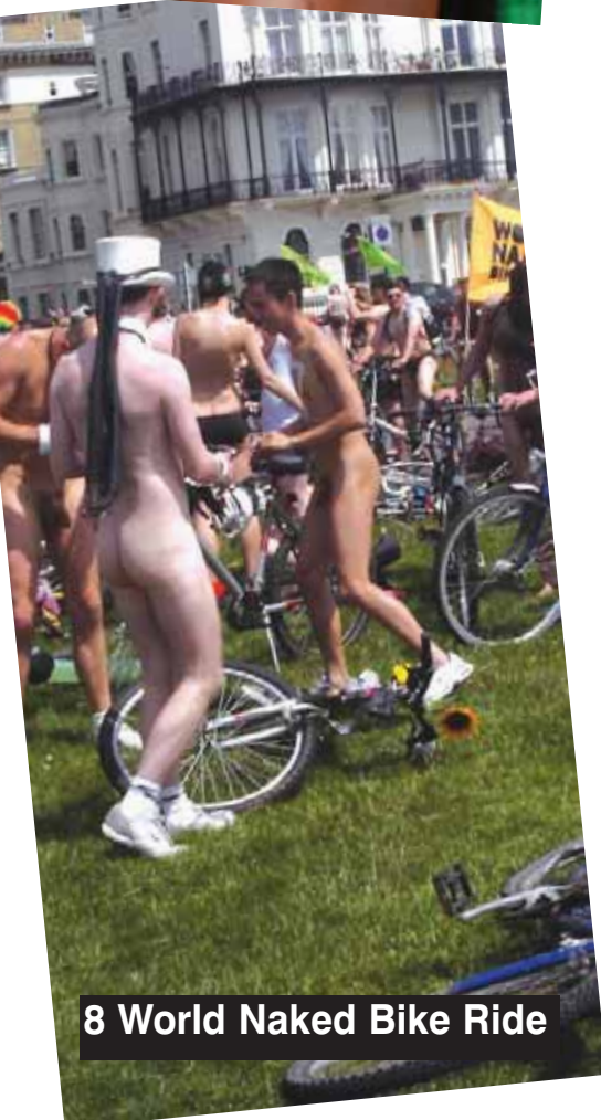
8 World Naked Bike Ride