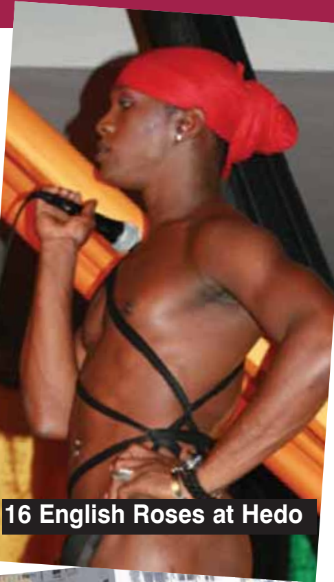
16 English Roses at Hedo