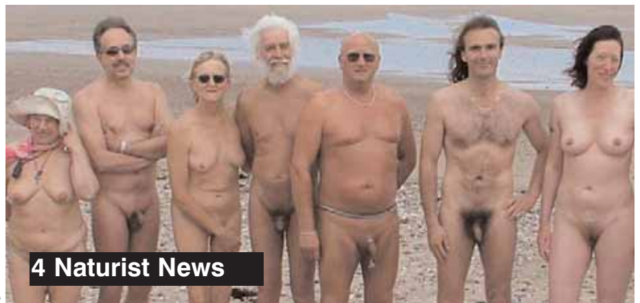
4 Nativist News