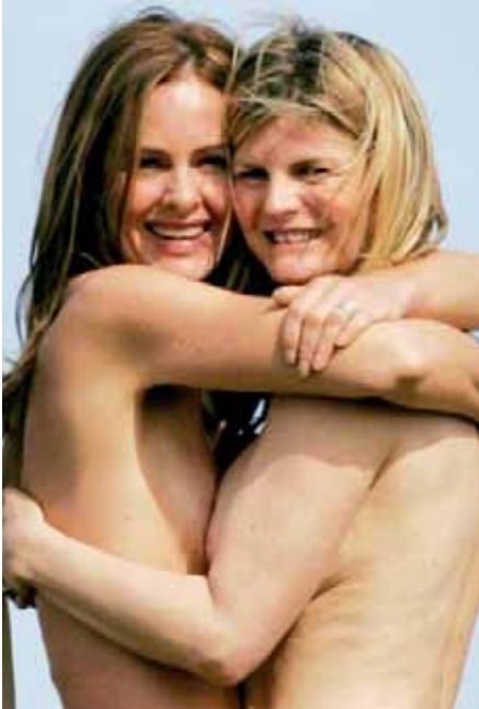
Cover photo of Trinny and Susannah